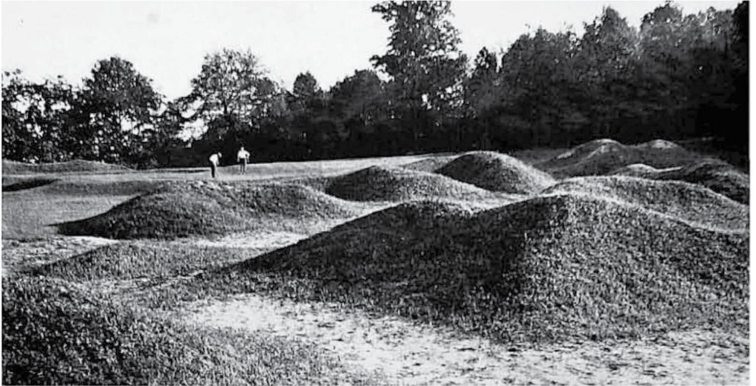
A FINE EXAMPLE OF MOUND BUILDING. THE 6 TH GREEN AT SOMERSET HILLS