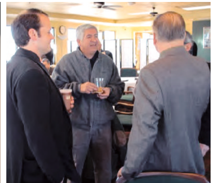
▲ I know, I know...pass attempt on 4th and goal?