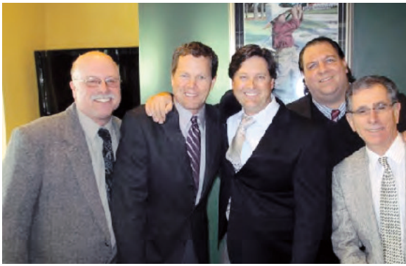
▲ 2012 GCSANC award winners