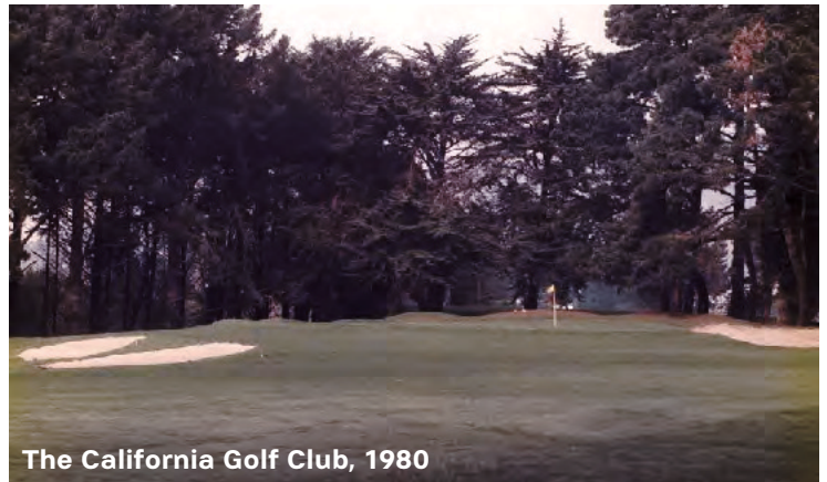
The California Golf Club, 1980