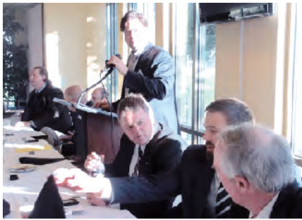
▲ I thought you were going to bring the chips and I was bringing dip!