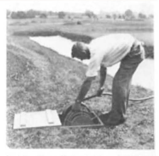
Invisibe Hose Reel provides convenient storage and lowers labor and hose costs.