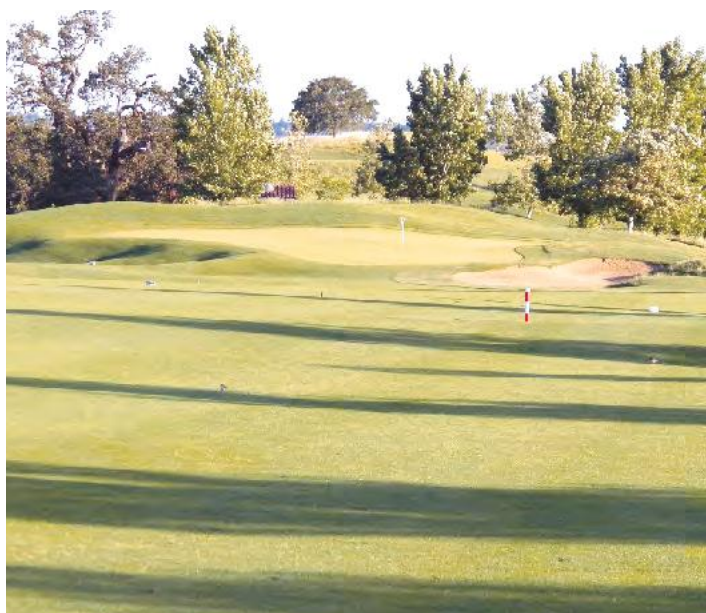
Empire Ranch Golf Club

Thru The Green published bimonthly by the Golf Course Superintendents Association of Northern California.