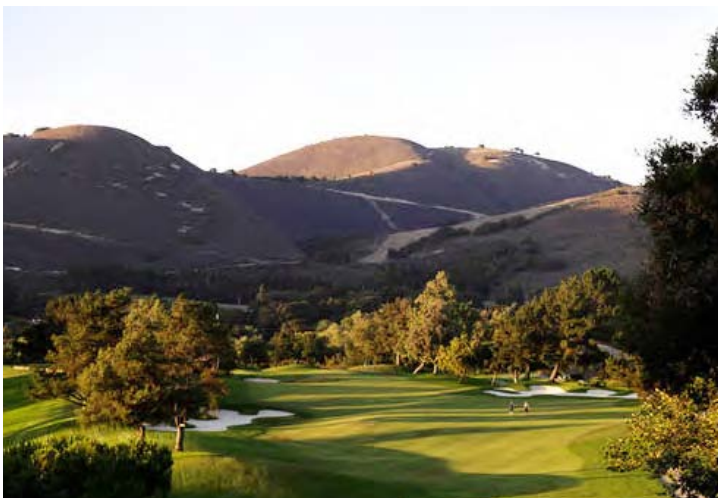
Carmel Valley Ranch

Thru The Green published bimonthly by the Golf Course Superintendents Association of Northern California.