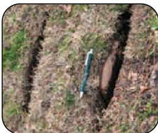
Prunes roots up to 5" in diameter with a maximum depth of 10"