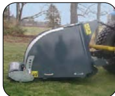
Perfect for drainage problems on greens, tees, fairways and roughs

FOR DEMONSTRATION, SERVICE, SALES OR RENTAL, CALL LARRY LANE