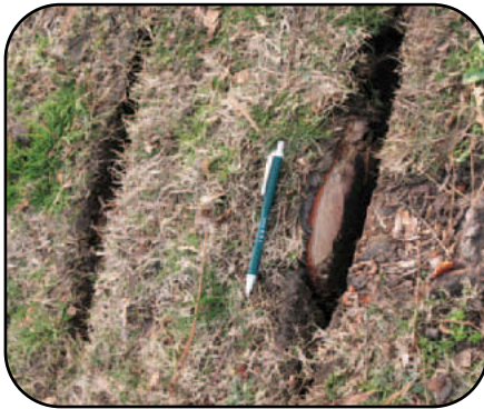
Prunes roots up to 5" in diameter with a maximum depth of 10"

FOR DEMONSTRATION, SERVICE, SALES OR RENTAL, CALL LARRY LANE