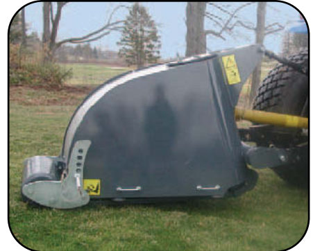
Perfect for drainage problems on greens, tees, fairways and roughs

TURF TIME WEST Toll Free: 1-800-994-0004 Cell: 1-714-812-7091