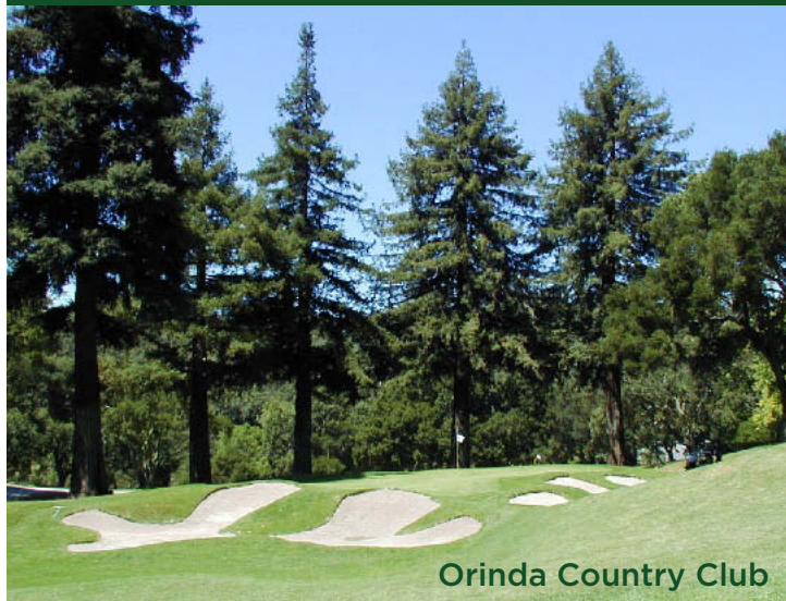
Orinda Country Club