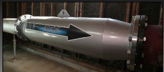
Installation at a Southern California Golf Course

Increase root growth and nutrient uptake