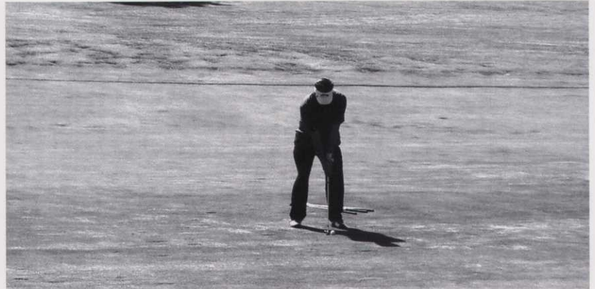
A Focused Competitor at the Scholarship Event