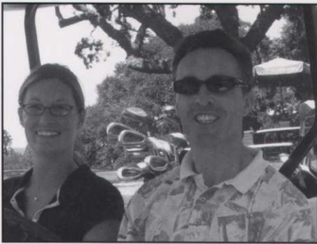
The President was in a Good Mood at Stanford Golf Course