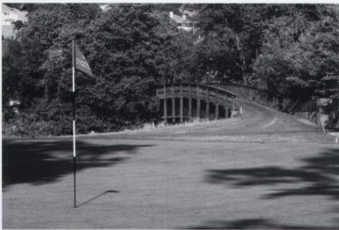
Silverado Country Club & Resort