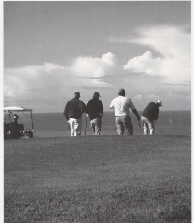
Behind 5th Tee