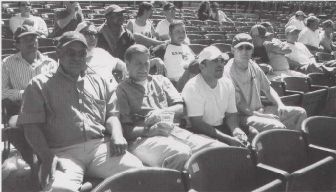
The guys from Stonetree enjoying the game