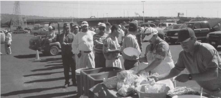
The Chow Line