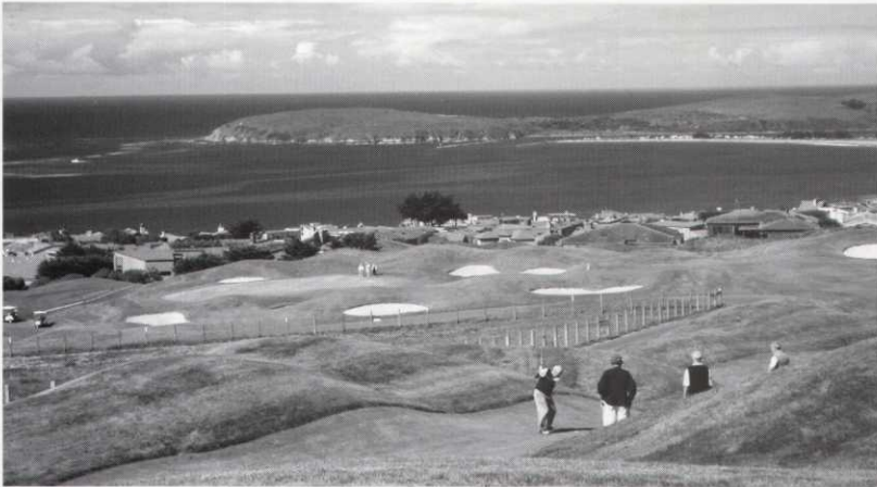
#5 Landing area