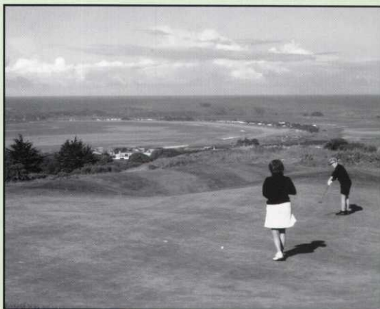
#4 at The Links at Bodega Bay Harbour

You can serve the GCSANC membership in other ways as well. Offering your club to host a meeting, participating in GCSANC sponsored research, writing an article for "Thru the Green", or responding to "survey questions" etc. So step forward, both you and your organization will be a lot better for it!