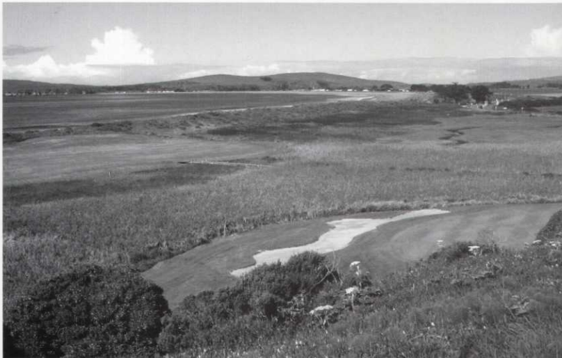
17th Green, 16th Fairway, Marsh & Head