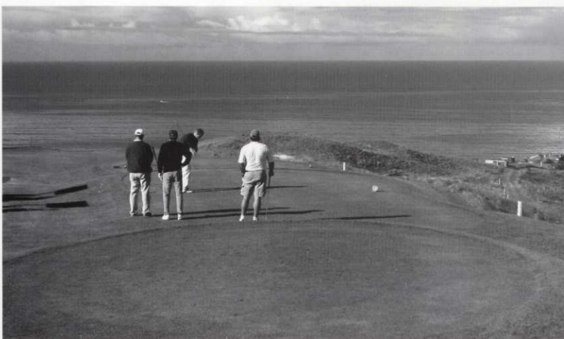
Foursome on 5th Tee