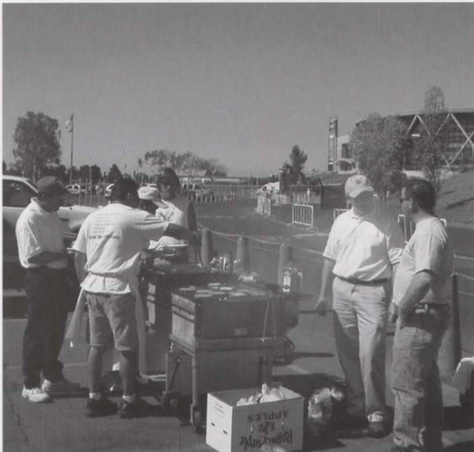
Around the Grill