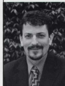
GCSANC Turfgrass Excellence Award (Private Category)