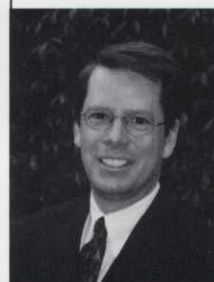
GCSANC Affiliate Merit Award