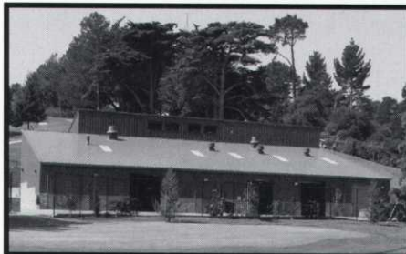
Green Hills Country Club Turf Care Facility

Ideal For All Your Turf Care Facility and Clubhouse Needs Custom designed for your specific requirements