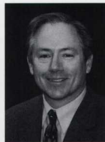
GCSANC Superintendent of The Year