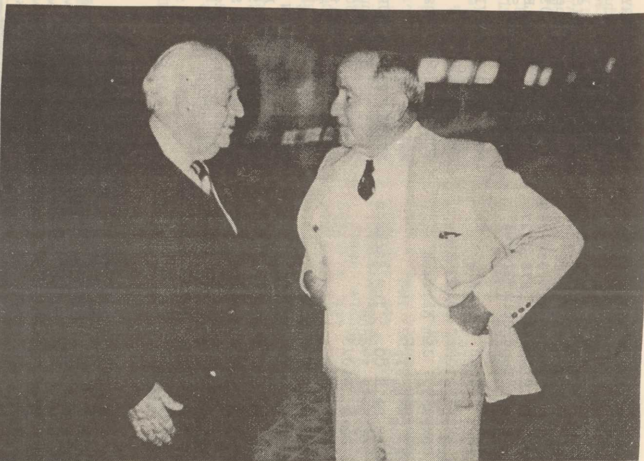
Robert Trent Jones and Gene Sarazen at the GCSAA Conf. and Show in Houston.