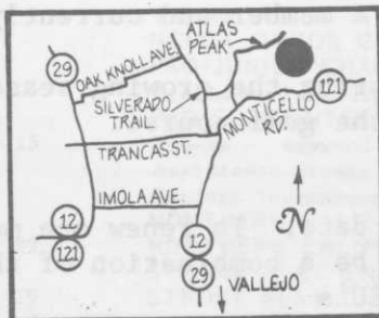
SILVERADO CC & RESORT 1600 Atlas Peak Road, Napa,

Silverado Country Club was built in 1967 and was a Robert Trent Jones design.