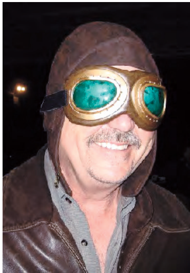
▲ The California Room on the USS Midway provided an interesting photo op.