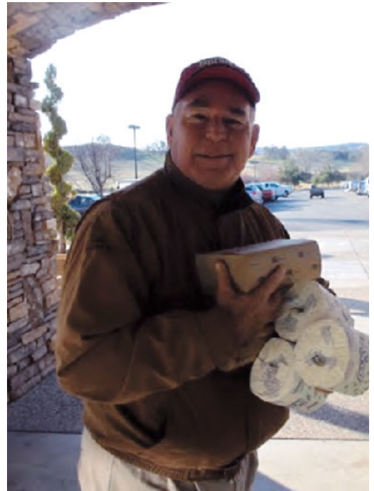
▲ Everybody check your shoes for TP.