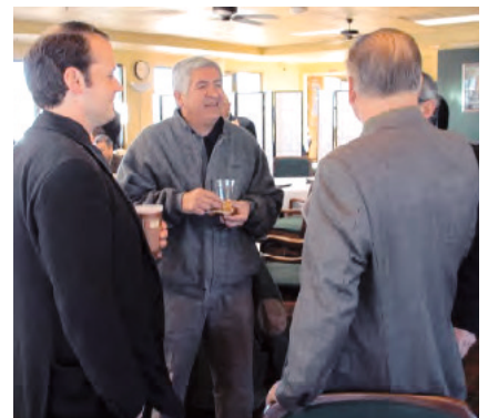
▲ I know, I know...pass attempt on 4th and goal?