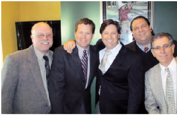
▲ 2012 GCSANC award winners