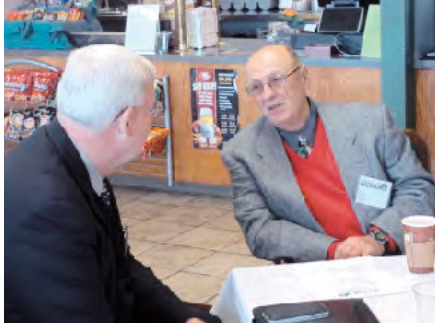
▲ I know, I know. 4th and goal we didn't run it...