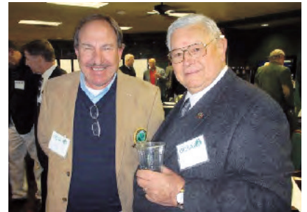
▲ Catching up with Friends