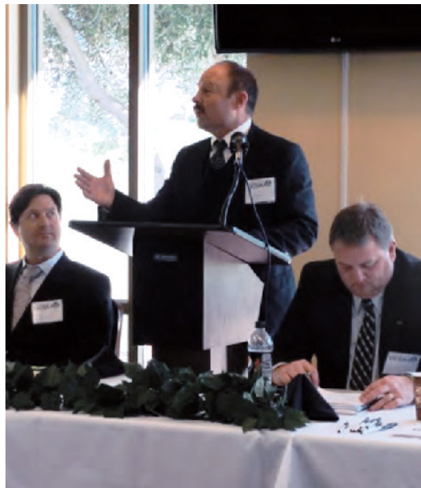
▲ There's a brown Audi parked in my space. Call a tow truck and have it towed immediately!