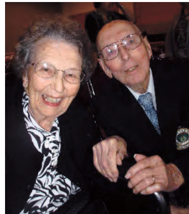
▲ Wagoners enjoying opening session at GCSAA GIS San Diego 2013