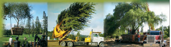
Los Altos C.C.

Protecting the integrity of California's golf courses.