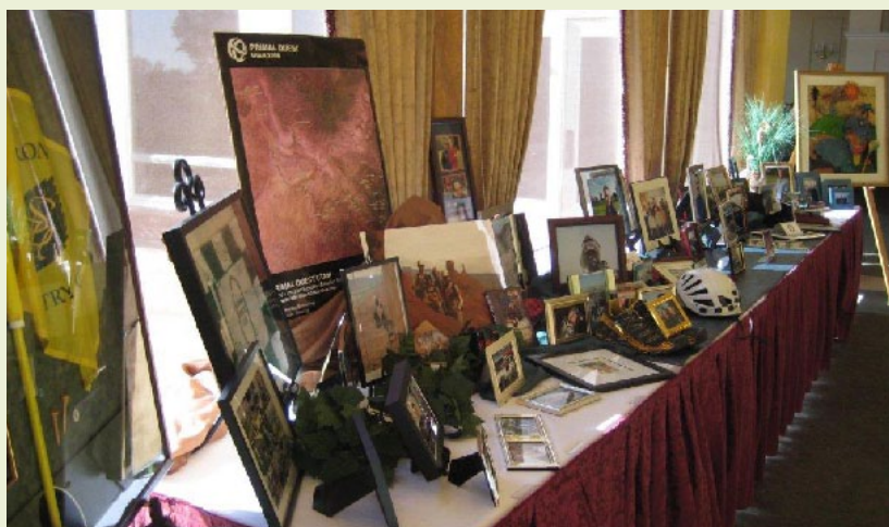
In tribute to recent award winners, there was a full display of photos and memorabilia highlighting the honorees and their many accomplishments.