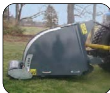
Perfect for drainage problems on greens, tees, fairways and roughs

FOR DEMONSTRATION, SERVICE, SALES OR RENTAL, CALL LARRY LANE