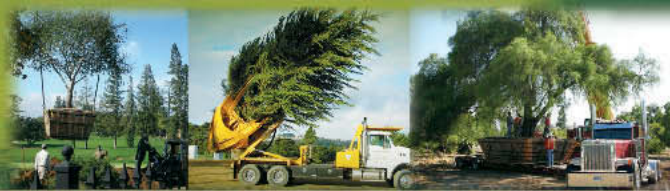
Los Altos C.C. 100" SPADE TREE BOXING