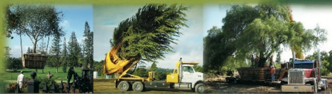
Los Altos C.C.

Protecting the integrity of California's golf courses.