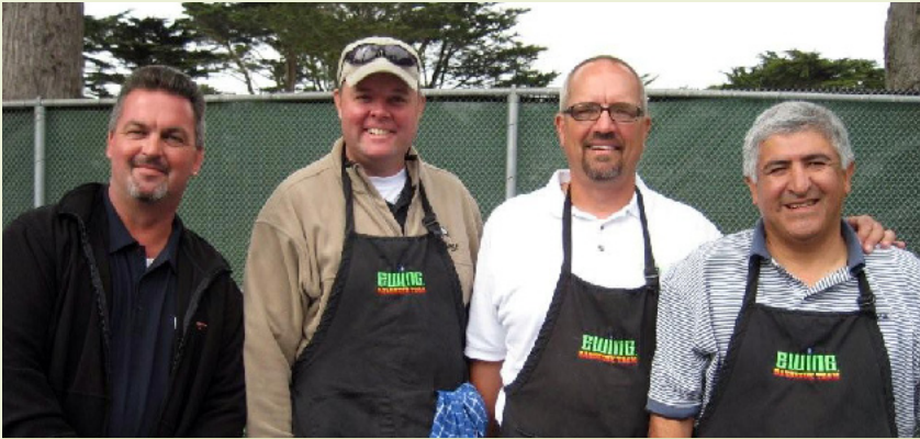
On Thursday, the team from Ewing provided a tasty barbecue for a hungry crew at Harding Park GC.