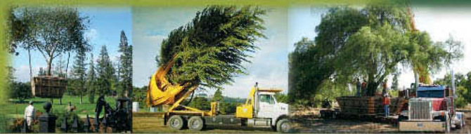
Los Altos C.C. 100" SPADE TREE BOXING