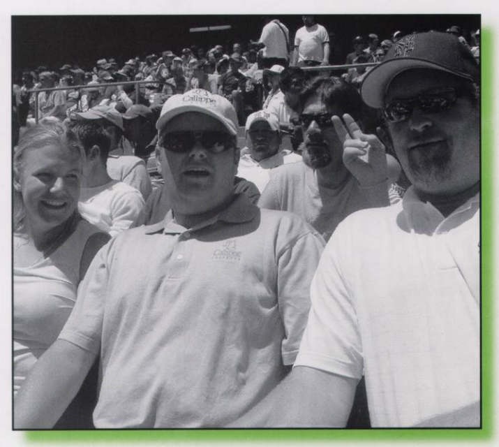
Fun was had by all including the crew from Calippe Preserve GC.