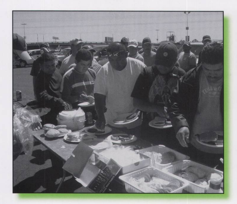
Crew members enjoying the pre-game barbeque.