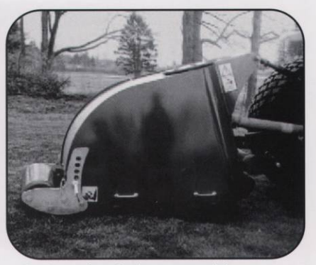
Perfect for drainage problems on greens, tees, fairways and roughs

FOR DEMONSTRATION, SERVICE, SALES OR RENTAL, CALL LARRY LANE