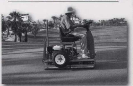
GSR1200 - GREEN'S ROLLER

Northern California Demo Tour - May 2008 Please contact to see any of the machines in action