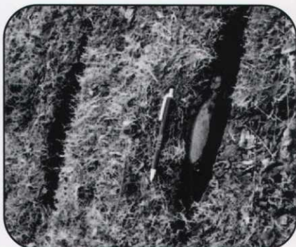
Prunes roots up to 5" in diameter with a maximum depth of 10"