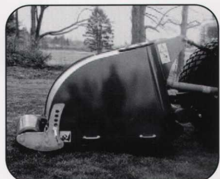
Perfect for drainage problems on greens, tees, fairways and roughs

TURF TIME WEST Toll Free: 1-800-994-0004 Cell: 1-714-812-7091