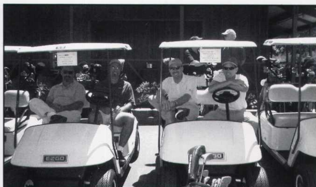
Ready to Rumble!