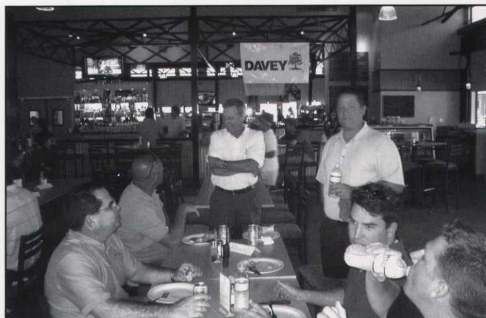
Lunch talk before golf