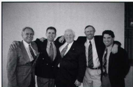
2005 Award Winners

The Golf Course Superintendents Association of Northern California