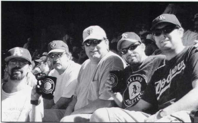
The Cal Clubbers enjoying a frosty beverage at the game, GO A's!