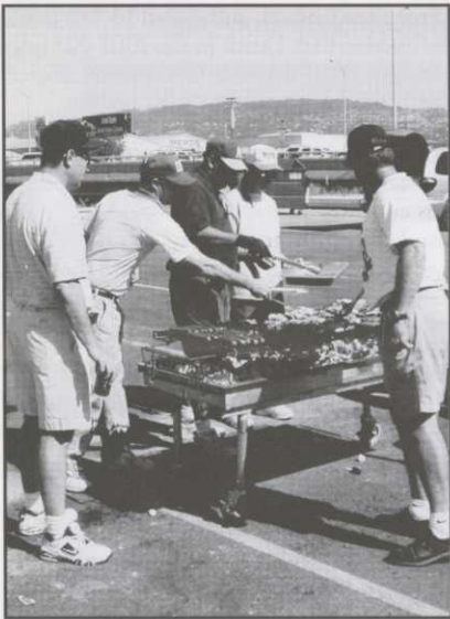
Where's the BEEF!!!!