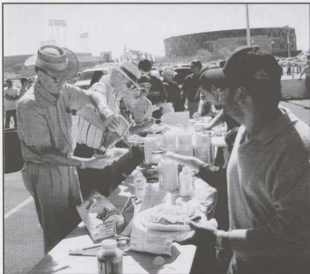
An-tic-ip-a-a-tion...is making me wait. Hungry tailgaters have little patience for condiments.