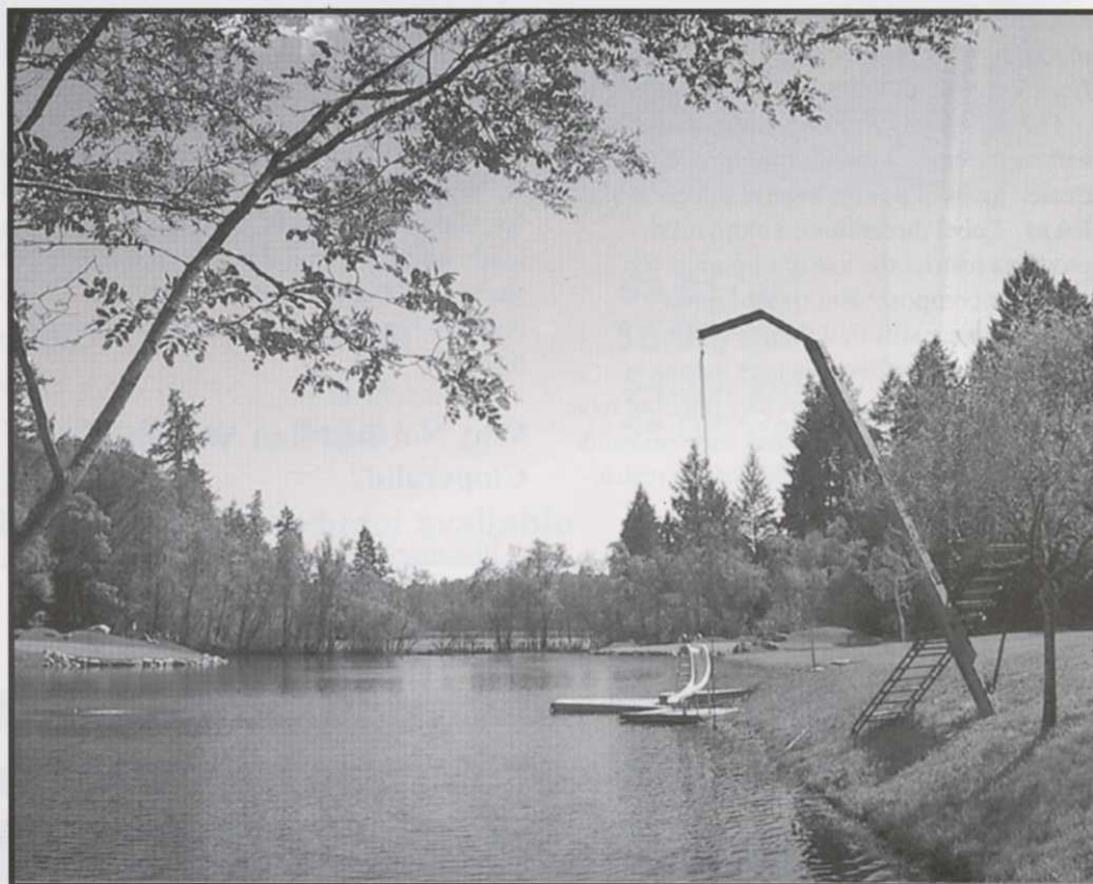
Tough choice — golf or swim at Robertson Golf Links