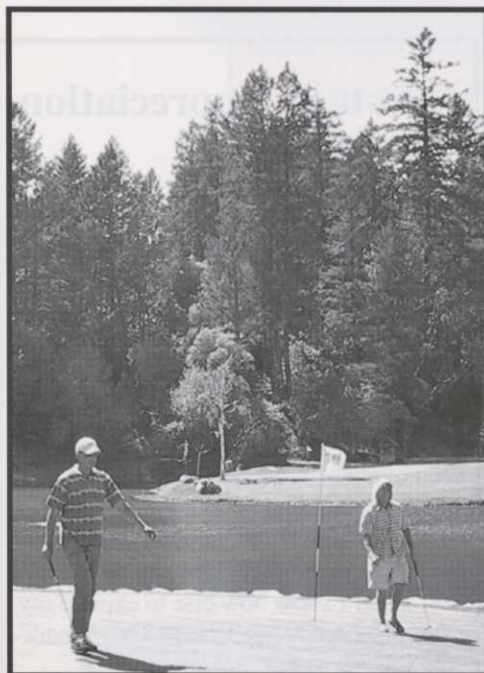
Course employees enjoying the afternoon golf