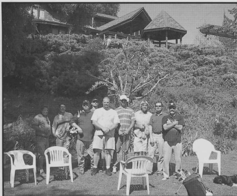
Some of Sonoma County's EGT participants

So, does any of this sound cool to you, my fellow colleagues? If it doesn't, I really don't care anyway! One thing for sure, there is nothing better than an afternoon of barbecue, refreshments, golf, and good friends to hang out with. It sure beats the hell out of working.