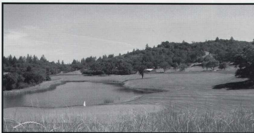
Below Right: view of the beautiful 10th hole at Mayacama