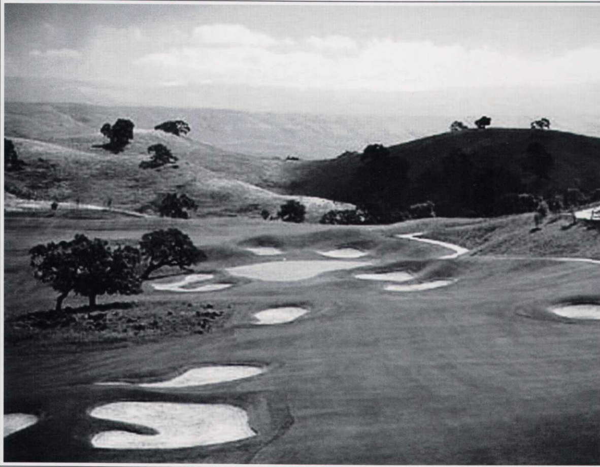
Cinnabar Canyon #1