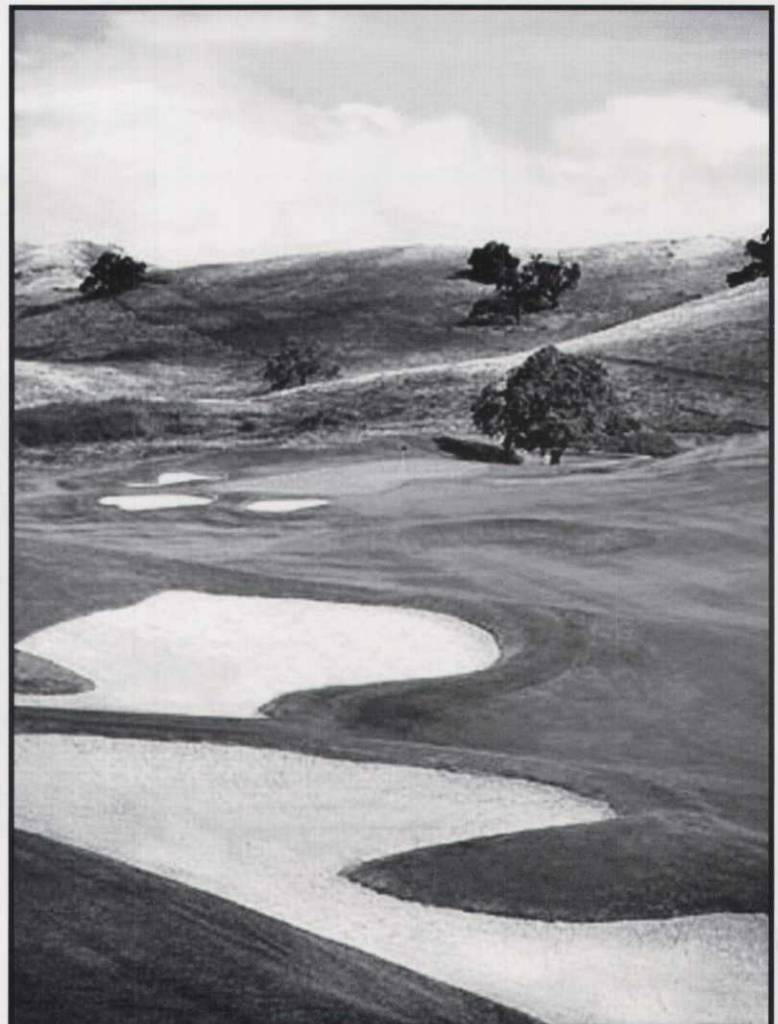
Top right: Cinnabar Canyon #8