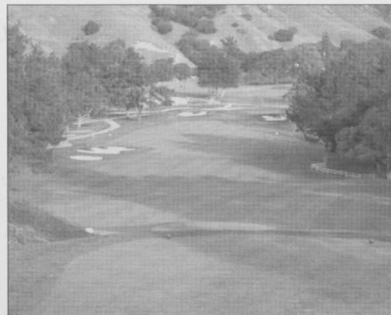
One of Corral de Tierra Country Club's signature holes.

In January 2000, Phase II of the renovation project began with perfect conditions for