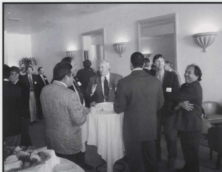
Breaktime at the USGA/NCGA Regional Conference