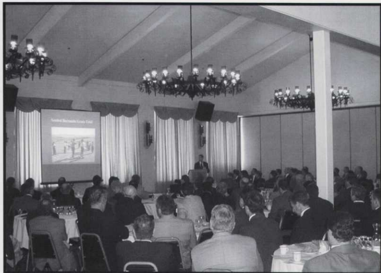
Attendees Listen to a presentation at the USGA/NCGA Meeting