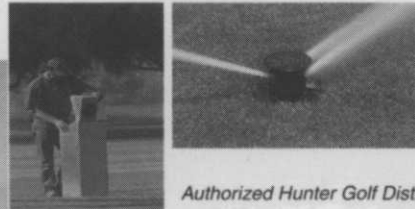
Authorized Hunter Golf Distributor