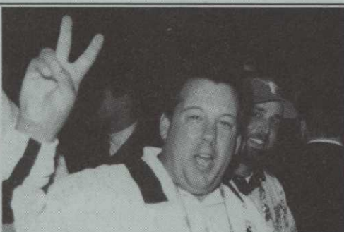
GCSAA Annual Meeting Dallas, Texas