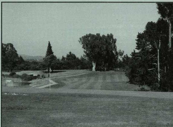
The 18th at De Laveaga