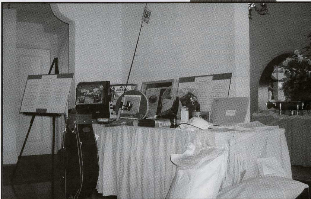
Below: The auction table at Orinda