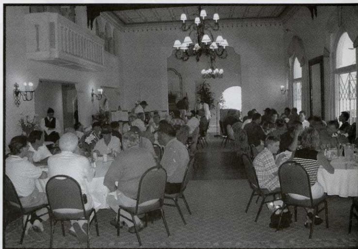
Participants enjoy lunch at Orinda Country Club