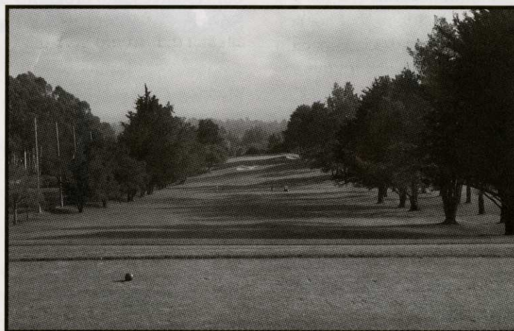
#1 at Pasatiempo