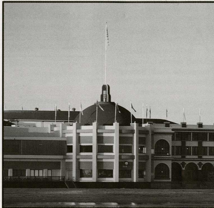
Cocoanut Grove Banquet and Conference Center - Santa Cruz