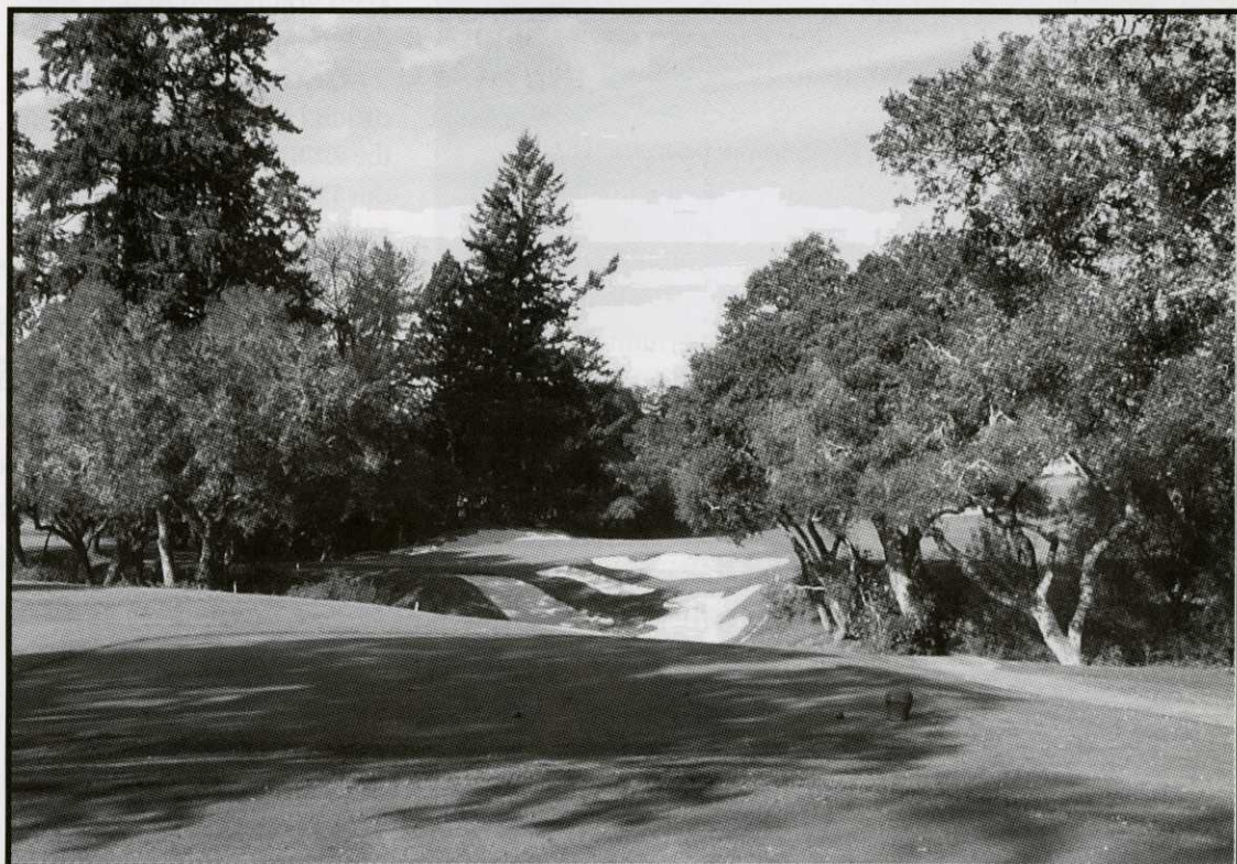
The newly restored 15th Green