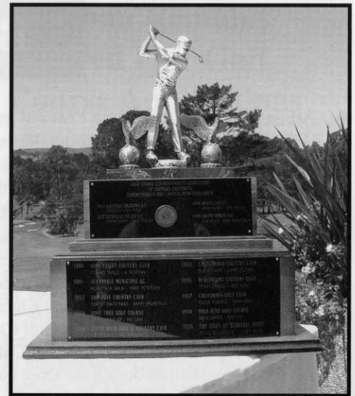
The Supt/Pro Trophy

According to Crystal Fricker, director of research, they totally destroyed the genetically modified grass experiment and dumped and scattered 200 pots of ornamental grasses collected from around the world. "I think it's ironic they killed so many plants that are naturally bred to be so environmentally friendly," Fricker said. "Our whole goal is to develop varieties that require less input (of pesticides and other chemicals) and that can better serve people around the world."/