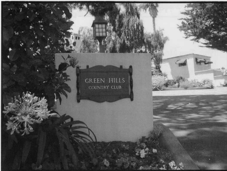
Entry to the beautiful Green Hills Country Club