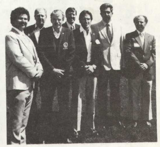
The 1988/1989 Board of Directors