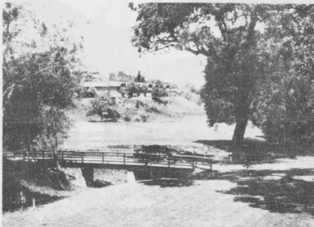
13th Hole Rossmoor