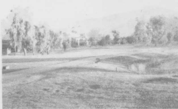
# 6 par 3 - 184 yds.