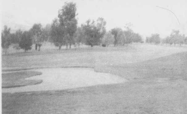
# 8 par 4 - 375 yds.