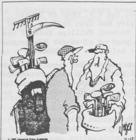
"Something tells me I'm in for a very long day."