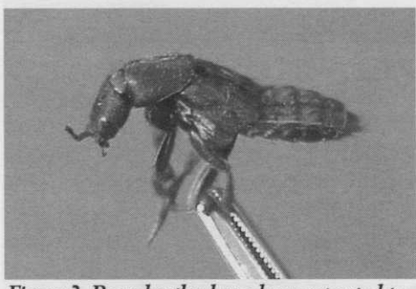
Figure 3. Rove beetles have been reported to be predators of various white grub species.