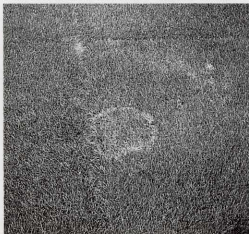
Fig. 1. A circular ring of mycelium of Rhizoctonia solani infecting perennial ryegrass mowed at fairway height.