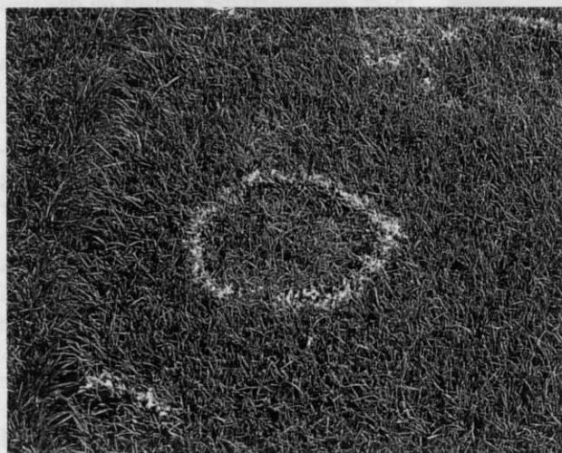
Fig. 1. Mycelium of Rhizoctonia solani , the causal agent of Rhizoctonia blight, infecting perennial ryegrass. This is referred to as a "sign" of the pathogen.

Rhizoctonia blight is considered to be a highly destructive, foliar disease on both cool- and warm-season turfgrasses.