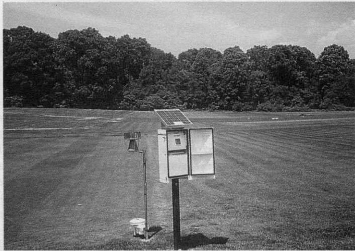
Fig. 3. Commercially-available weather station with built-in pest prediction models or pest alert programs.

Through multiple regression analysis of the data, mean relative humidity and minimum air temperature provided the best and simplest model for accurately predicting the EFI, and therefore for providing an accurate Rhizoctonia blight warning. An objective of this research was to develop a disease prediction method that was simple, accurate, and practical. For example, information regarding the length of leaf wetness duration, hours of continuous relative humidity >90%, and rainfall events were helpful to determine the EFI. However, leaf wetness sensors were difficult to calibrate and required a high level of maintenance, which was not considered practical for today's greenskeeper. In another example, the mean relative humidity over a 24-hour period was highly correlated with continuous hours of relative humidity >90% or >95%. Therefore, the mean relative humidity in a 24-hour period could be used to accurately account for those humidity variables measured in this research. Also, air temperature and relative humidity are easy and convenient to measure and record with today's technology in weather stations, or with weather satellite data downloaded to a