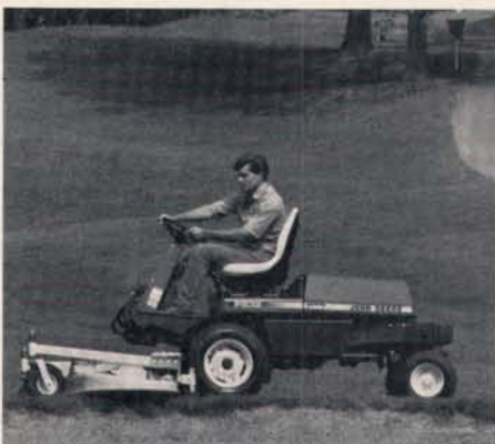
Deere F932 out-front rotary mower quickly trims around sand trap.

larger diameter reels. The rule of thumb is the turf must be shorter than half the diameter of the reel.