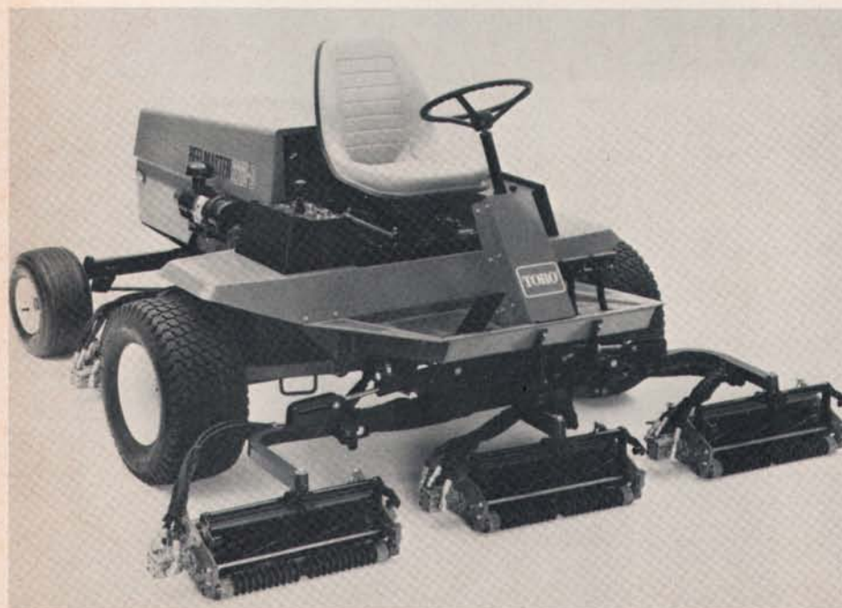
Toro Reelmaster 223-D lightweight fairway mower.

It's important to note that the demand for lightweight equipment grew because the superintendent and sports turf manager were experimenting to improve specialized turf under their care. Specialized is the key word. Lightweight fairway mowers are