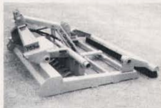
ComboPlane™ with optional attachment

MT/ComboPlanes™ give you superior grading performance, every time. Three scarifier options for different ground compaction conditions, positioned for maximum penetration, hydraulically controlled. Scraper moves dirt, determines grade. Planing beams flow the soil evenly. Plus a variety of finishing attachments for professional results on ballfields, sod and seed beds, parking lots, running tracks, golf courses. MT/Comboplanes are ruggedly built for long life and low maintenance, with abrasion-resisting steel in critical wear areas.