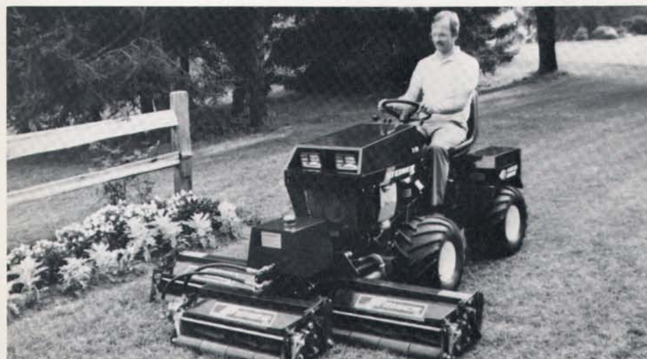
The Steiner tractor articulates in the center and features four-wheel drive. It can support a wide range of attachments both front and rear.