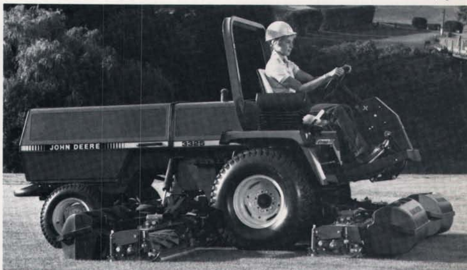
John Deere's 3325 Pro Turf Mower cuts a 138-inch swath as low as 3/8 inch. Instruments monitor 12 different operating functions.