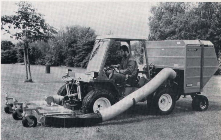
The Metrac 3003K from Lely is a highly flexible prime mover that can operate attachments on both front and rear. The low-profile machine has four-wheel drive and steering.