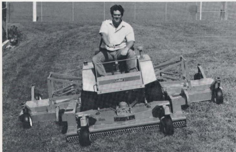
The Excel Hustler Range Wing mower can cut 60 acres of turf in an eight-hour day.