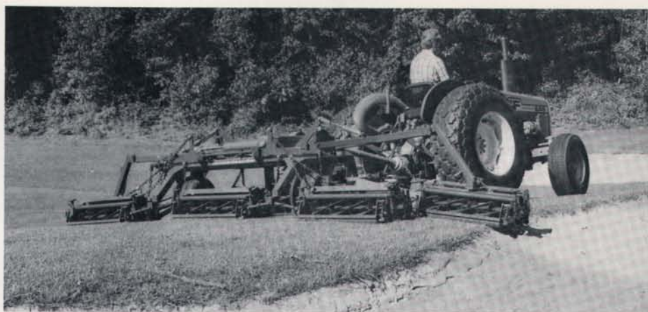
Brouwer powers the reels on its seven-gang with the tractor PTO but uses hydraulics to raise and lower them for transport.

The next step for mowers is advanced control, predicts David Legg of Ransomes, Inc. Digital read-outs will tell the operator information critical for operation and maintenance. Reel mower operators will be able to know what speed the reels are turning in addition to ground speed. They will be able to check an entire list of engine and