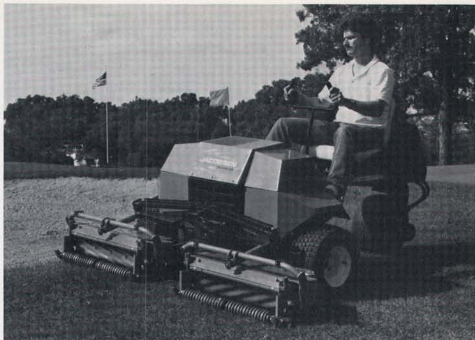
Three-wheel drive provides improved traction and maneuverability for Jacobsen's Tri-King 1471 triplex reel mower.

Changing standards for greens are having