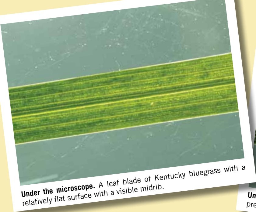
Under the microscope. A leaf blade of Kentucky bluegrass with a relatively flat surface with a visible midrib.