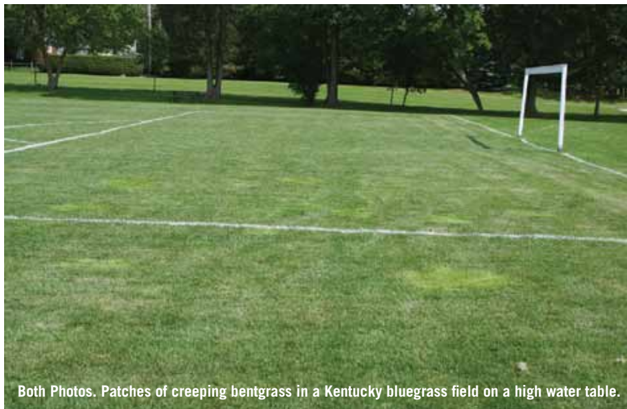
Both Photos. Patches of creeping bentgrass in a Kentucky bluegrass field on a high water table.

athletic field manager. It has not taught you how to identify turfgrasses. In actuality there is only one way to get good at turfgrass identification: practice repeatedly. In addition, you need to ask questions and access resources available to you. There are many good turfgrass identification keys available on the internet or in print format. Utilize them and try to improve your skills at differentiating